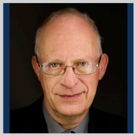
Prof. Oliver Hart Professor of Economics Harvard University