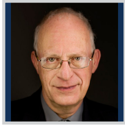
Prof. Oliver Hart Professor of Economics Harvard University