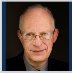
Prof. Oliver Hart Professor of Economics Harvard University