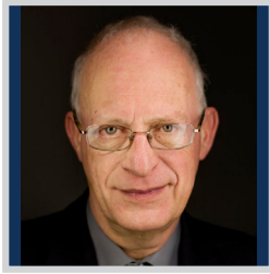
Prof. Oliver Hart Professor of Economics Harvard University